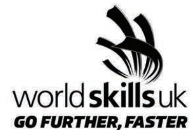
Mono black logo