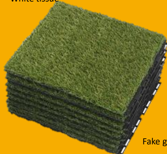
Fake grass panels 1m 50 Sq each