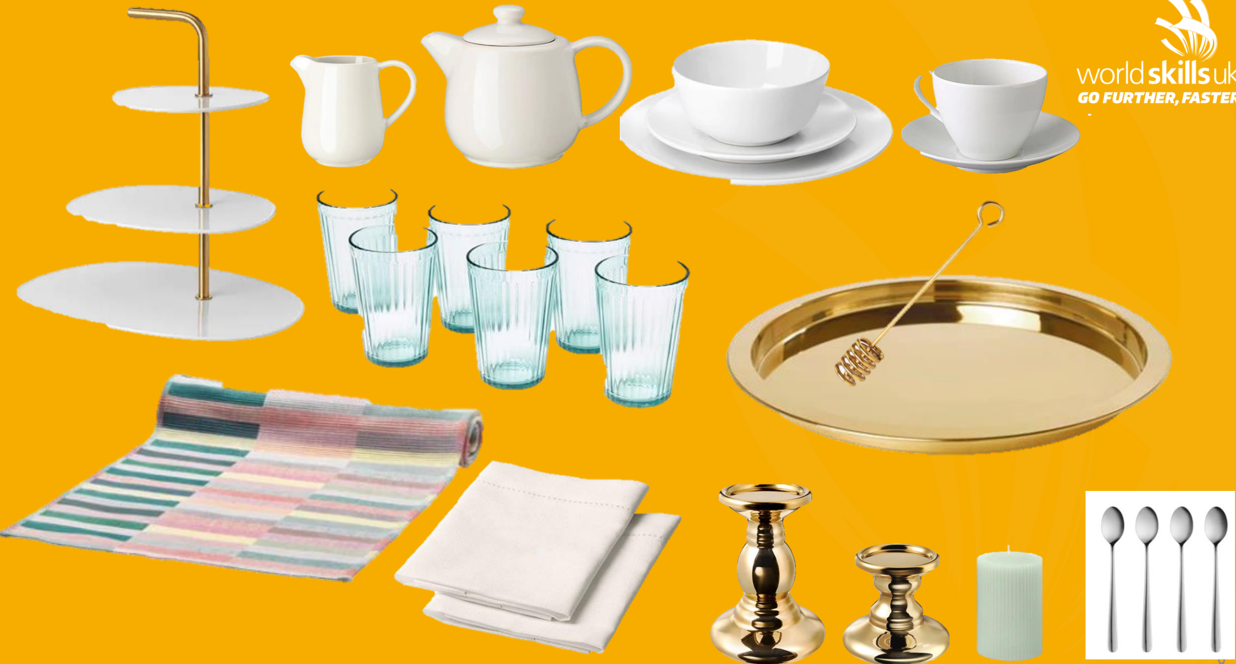
Suggested product, the actual product might change, it will however be similar (4 cups/ saucers, bowls, plates)