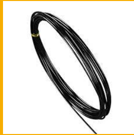
Black wire 10mt