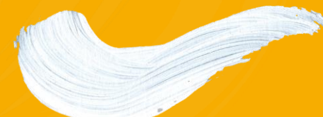
Vinyl matt paint 1 lite of each colour