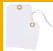
X 40 each